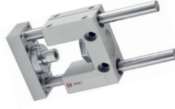
MLCUB - Sinter Bronz Burçlu U Yatak (ISO6432)