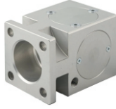
VRL - Silindir Mil Kilidi