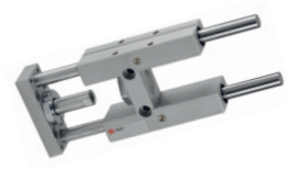
MLCHB - Sinter Bronz Burçlu H Yatak (ISO6432)