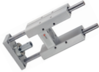
VLCHB - Sinter Bronz Burçlu H Yatak (ISO1552)